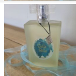
Belle (Inspired by Lancome la vie est Belle) Read More