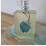
Amy (Inspired by Amàrige) Read More