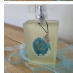
Chere (Inspired by Miss Dior Cherie) Read More