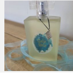
Amuse (Inspired by Estée Lauder Modern Muse) Read More