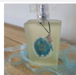
Dora (Inspired by Elizabeth Arden Red Door) Read More