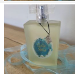
Anna (Inspired by Cacharel Anais Anais) Read More