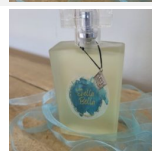
Angel (Inspired by Thierry Mugler Angel Ladies) Read More