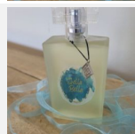
Classgaultier (Inspired by Jean Paul Gaultier Classique) Read More