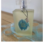
Alienate (Inspired by Thierry Mugler Alien) Ladies Read More