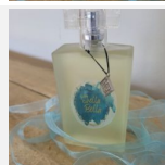
Flodaisy (Inspired by Marc Jacobs Daisy) Read More