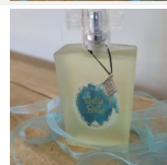
Barcin (Inspired by Estee Lauder Cinnabar) Read More