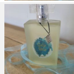
Choo. (Inspired by Jimmy Choo) Read More