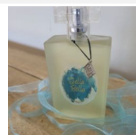
Doorja (Inspired by Dior J'adore) Read More