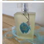
Baby (Inspired by Johnson's Baby scents) Read More