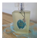
Greenapple (Inspired by DKNY Be Delicious Green) Read More